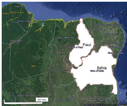
Figure 1. Map of Brazil showing the two states, Bahia and Piauí, where data was collected. For the studied municipalities, small properties are less than 260 ha in Bahia and 280-300 in Piauí. Quantitative surveys were conducted with 1,177 smallholders (n=851 across 5 municipalities in Bahia and n=326 across 6 municipalities in Piauí). We randomly selected participants with the help of technicians from the ProCerrado program supported by the ICF. We also conducted semi-structured interviews with randomly selected respondents in the quantitative survey (20 in Bahia and 22 in Piauí).

We collected household data from April-July 2016 on farm characteristics, income and expenditures, agricultural production, problems and opportunities associated with registering for the CAR, and intended behavioral changes following CAR registration. The research covered 11 municipalities in the States of Bahia and Piauí in the Cerrado biome (see Figure 1).